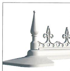
Sceptre Finial, Elizabethan Cresting