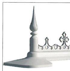
Classic Finial, Classic Cresting