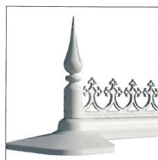
Classic Finial, Baroque Cresting