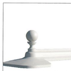
Ball Finial, Low Profile Cresting