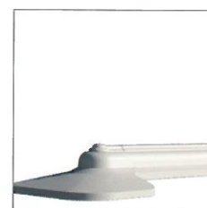
Low Profile Ridge / Cresting

Not all crestings and finials are exchangeable / compatible with each other. In certain situations - e.g. colours - not all options are available.